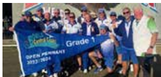
Open Grade 1