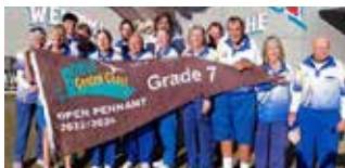
Open Grade 7