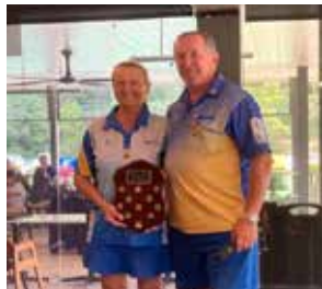
Presidents Avoca Beach Bowling Club and Wyong Bowling Club