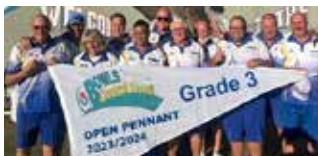
Open Grade 3