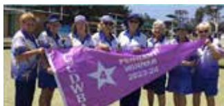
Women's Division 4