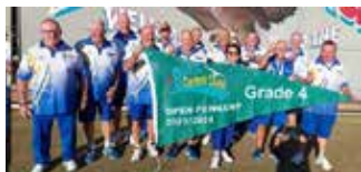
Open Grade 4