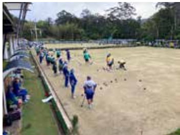
Winners Wyong Bowling Club